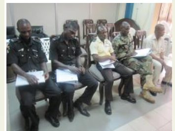
Human Rights Training for Security Forces facilitated by NIDPRODEV

articulated it best, when he stated that, "Freedom from want, freedom from fear, and the freedom of future generations to inherit a healthy natural environment – these are the interrelated building blocks of human – and therefore national – security." These words encompass our vision for Nigeria.