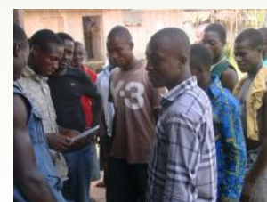
Youth residents of Agge Palmbush, Ekeremor LGA, Bayelsa State

“The Amnesty Programme of 2009, has reduced incidences of violence by armed militants. However, other aspects of human security are yet to be met.”