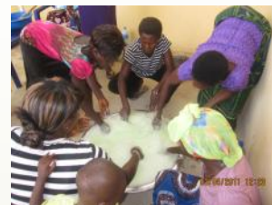
ONLAG participants learning soap making skills for income generation.

tion; and food security: improving agricultural techniques for farmers resulting in improved farm yields. NIDPRODEV concluded the first phase of this project in September 2011. and recently received funding from Oxfam Novib to strengthen implementation in existing communities and expand to 10 additional communities.