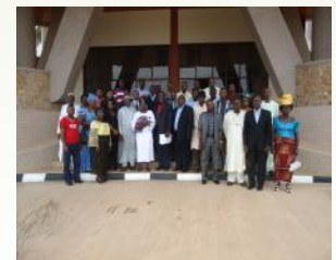
Participants at the Akure Conference on the sharing of the findings of the Niger Delta CRC

“The CRC is a tremendous step in advancing human development through good governance.”