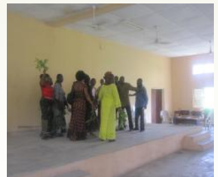
Theater for Development drama on women's participation in community decision making.

to analyze the lack of female participation in governance. The training resulted in verbal commitments by several community leaders to designate positions for women in community decision making structures. Following the training women met informally to develop a plan of action.