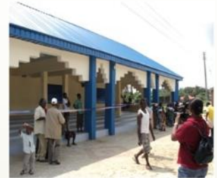
Commissioning of Civic Centre in Ahgoro I&II, Iduwini.

lighted that Agro based skills acquisition trainings were provided to 60 youth in May. The Nembe City Development Foundation (NCDF) reported that they attracted funding from PACT-Nigeria and USAID, accomplished through proposal development assistance from NIDPRODEV. Additionally, NCDF was awarded 14 new projects from SPDC.