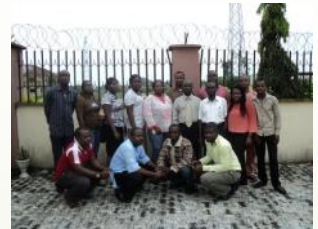
NIDPRODEV Staff at Strategic Planning Retreat.

This shift was done in an effort to reposition the organization to address Community Development, Democracy and Governance and Human Security in the Niger Delta and globally through programming, research, policy formulation and analysis and participation in national, regional and international networks and institutions.