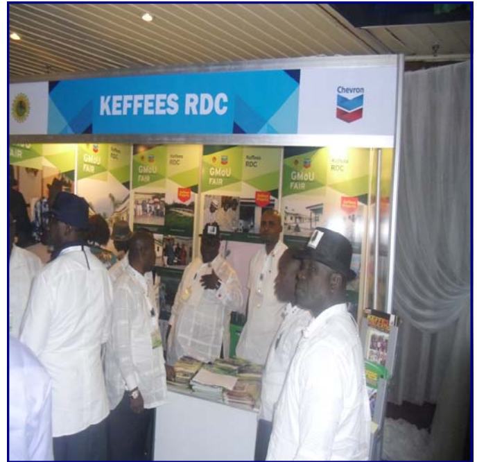
Keffes RDC Booth at the GMoU Fair

Leadership Initiative for Transformation and Empowerment (LITE -Africa) has been involved in the Global Memorandum of Understanding (GMoU) processes with Chevron Nigeria Limited (CNL) providing mentoring and oversight support to two Regional Development Councils (RDCs); Egbema Gbramatu Community Development Foundation (EGCDF) and KEFFES Regional Development Foundation (KRDF)