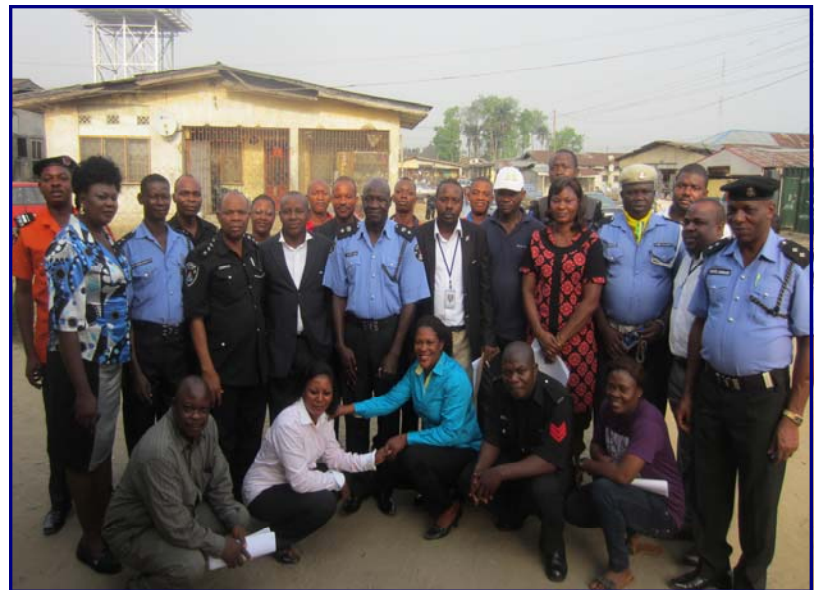
Police officers at the Awareness Session at B-Division, Warri