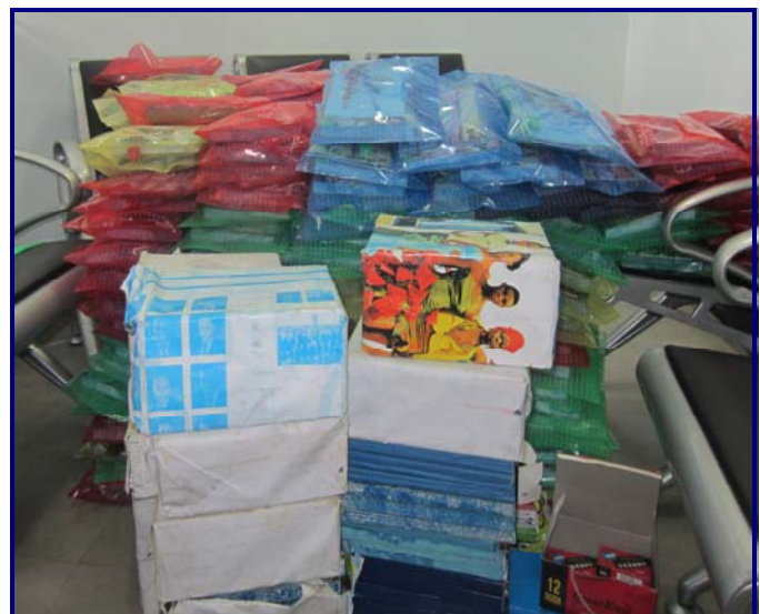
Educational Packs for Participants of the ONLAG Adult Literacy Class