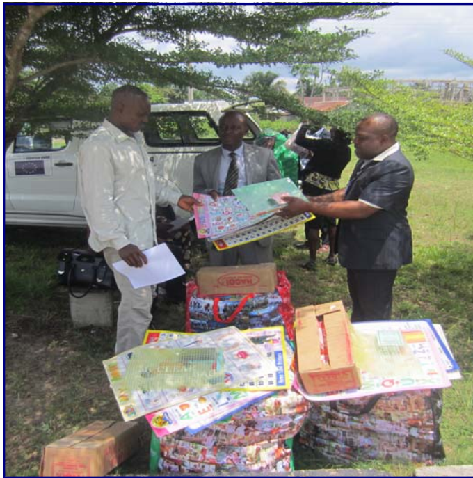
Handover of Trainings Materials to Facilitator of ONLAG Adult Literacy Training at Gbokoda Community.