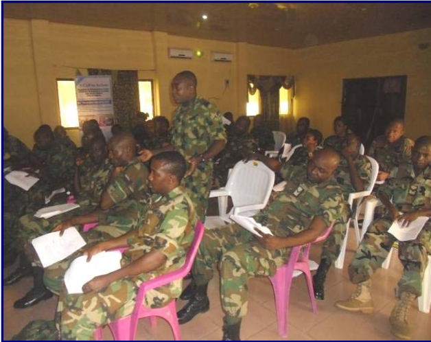
Military officer asking questions during the VP sensitization at the Military Barracks