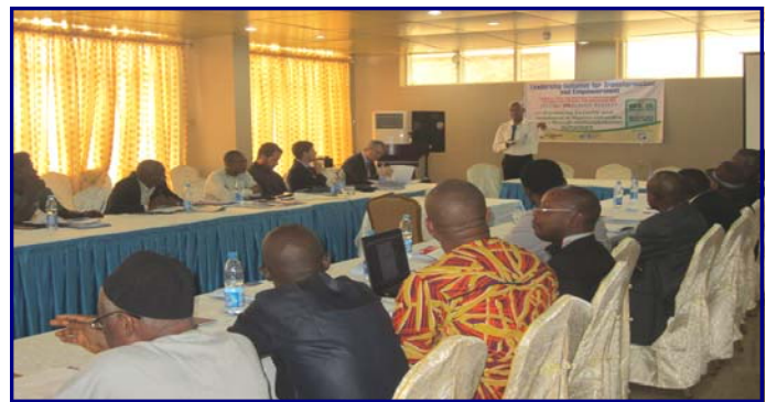
Chairman, Governing Council National Human Rights Commission presenting a keynote address at the International Call to Action Conference in Abuja

funding by the CSOs, leading to a lack of state sovereignty and supremacy on the issues of the VPs and the question of how can they dictate to us?