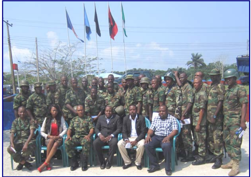
Military Personnel at the Awareness Session in 19 Battalion Koko.